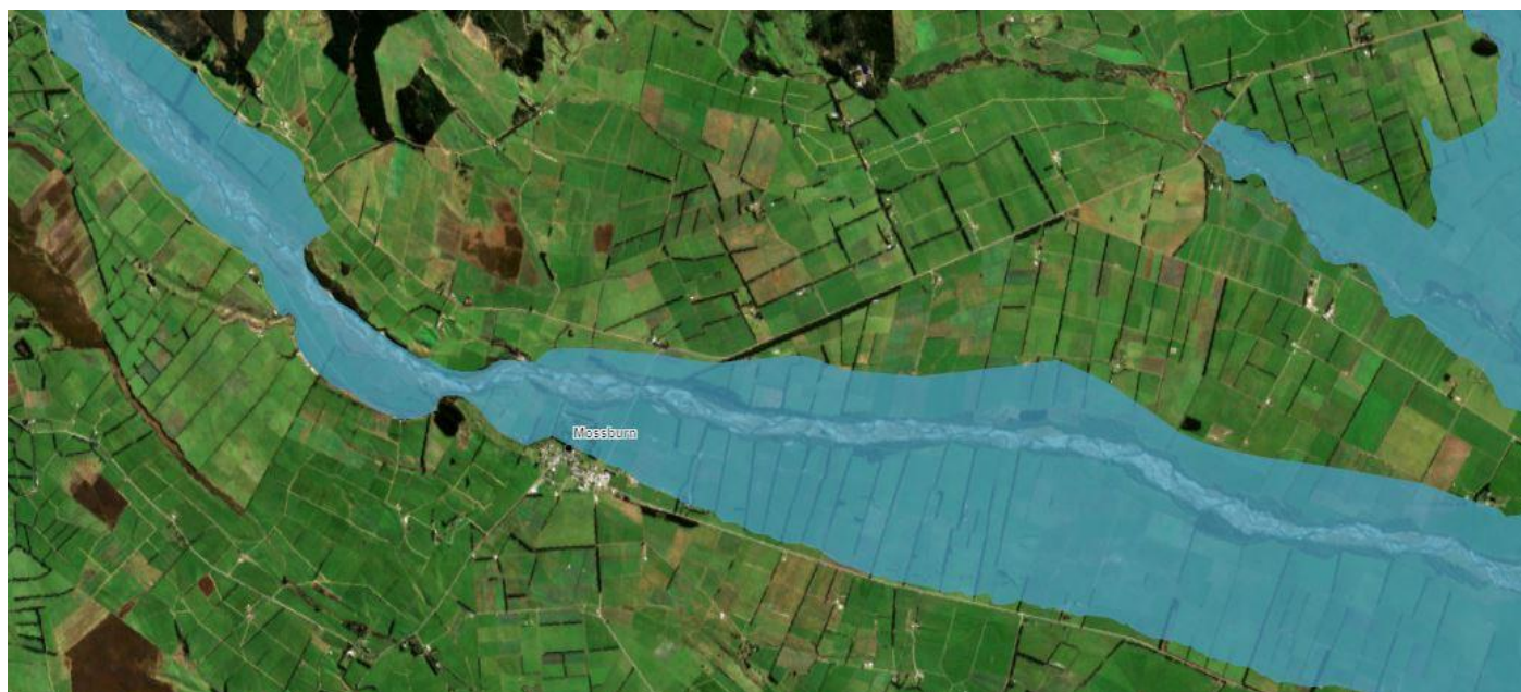
Figure 4: Mossburn Flood Map