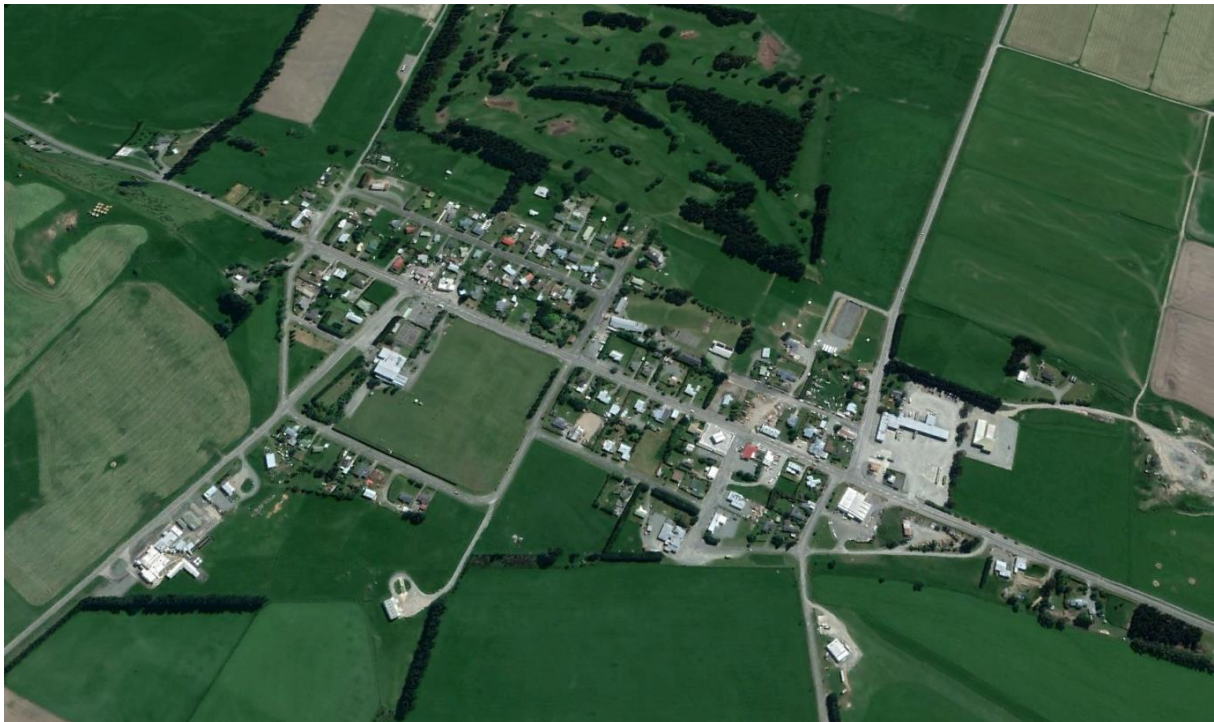
Figure 2: Mossburn Town