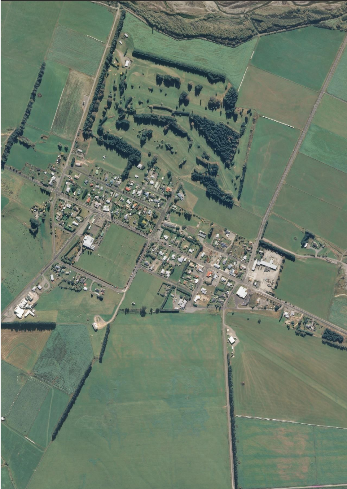
Figure 3: Mossburn Arial Map