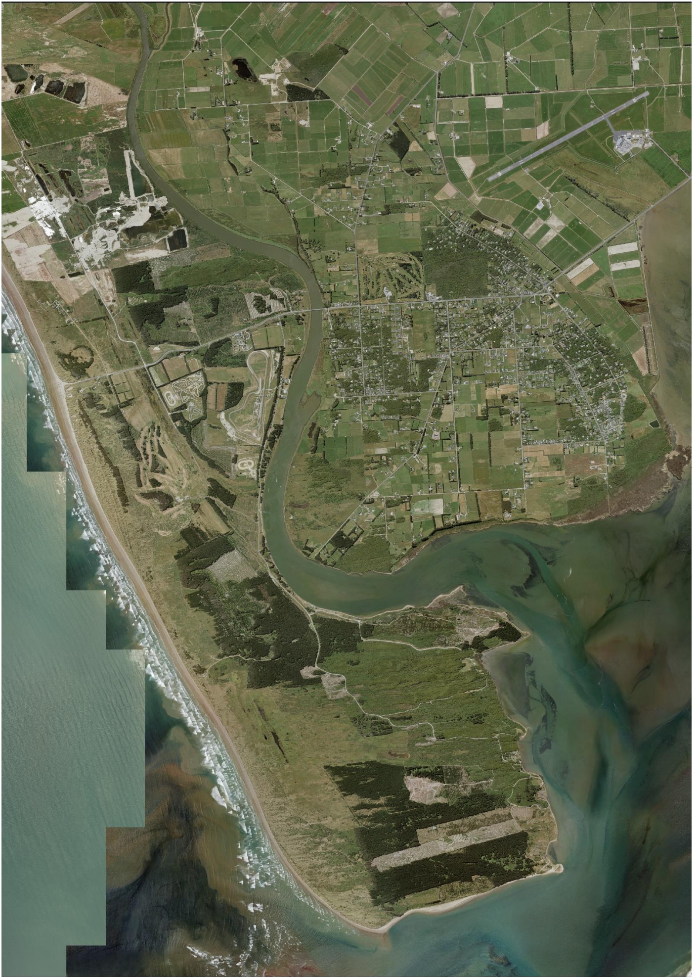
Otatara Community Response Plan Version.1