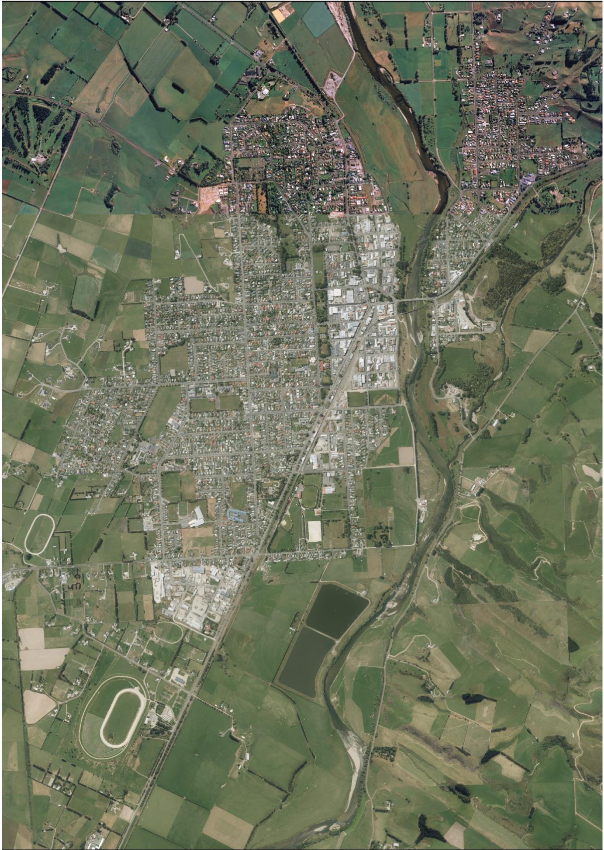
Figure 2: Gore Aerial Map