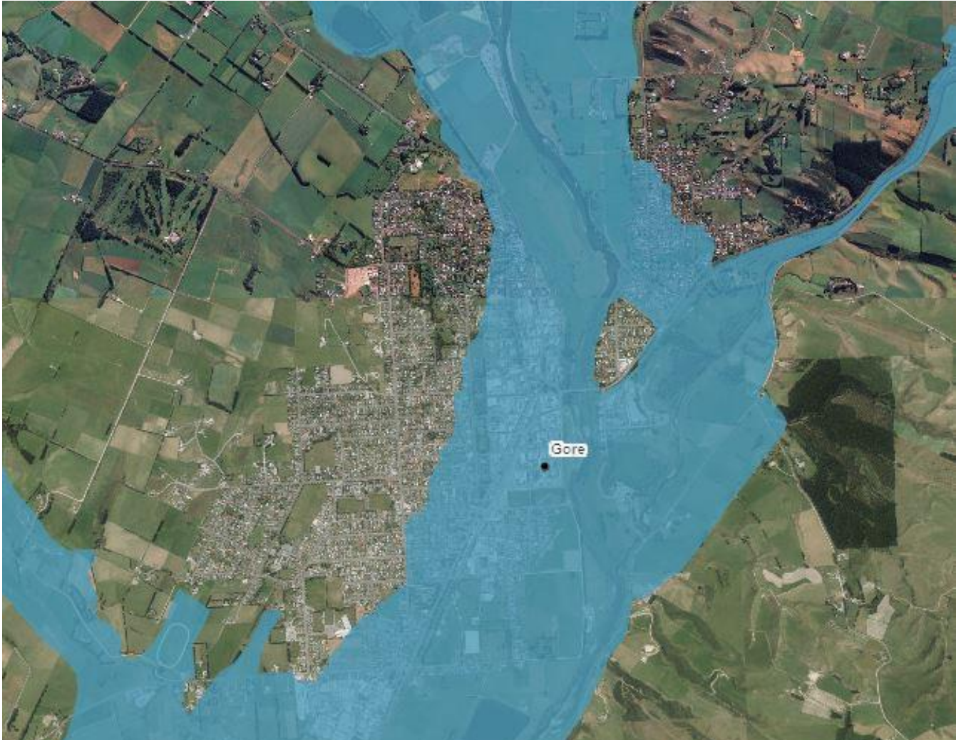
Figure 3: Gore potential flood Map