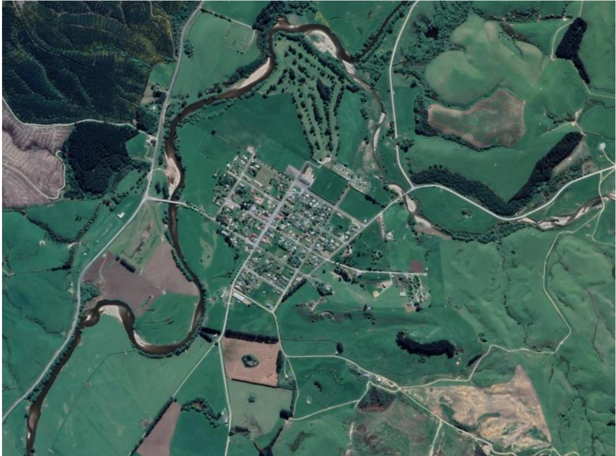
Figure 4: Waikaia Aerial