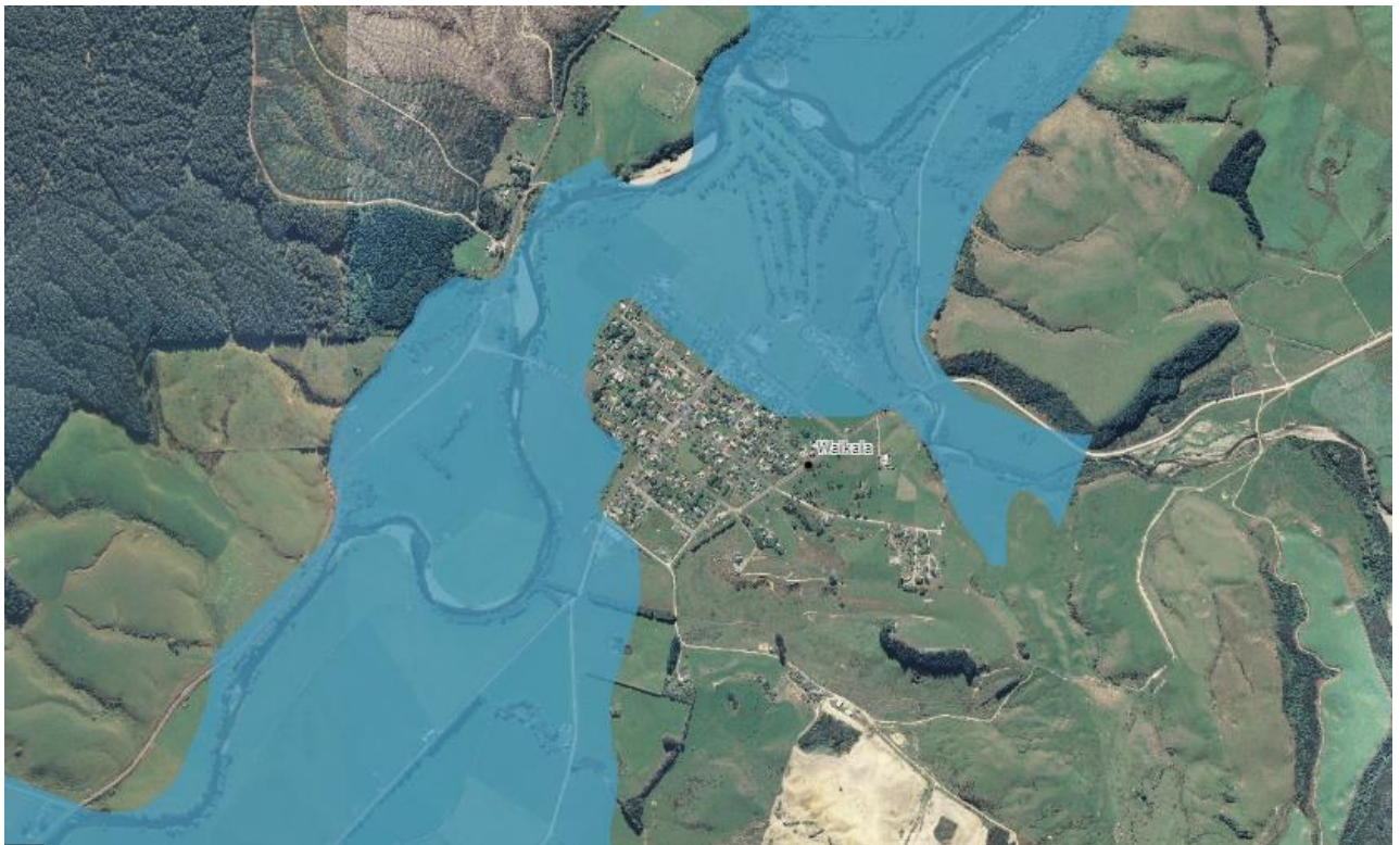
Figure 2: Waikaia Potential Flooding Zone