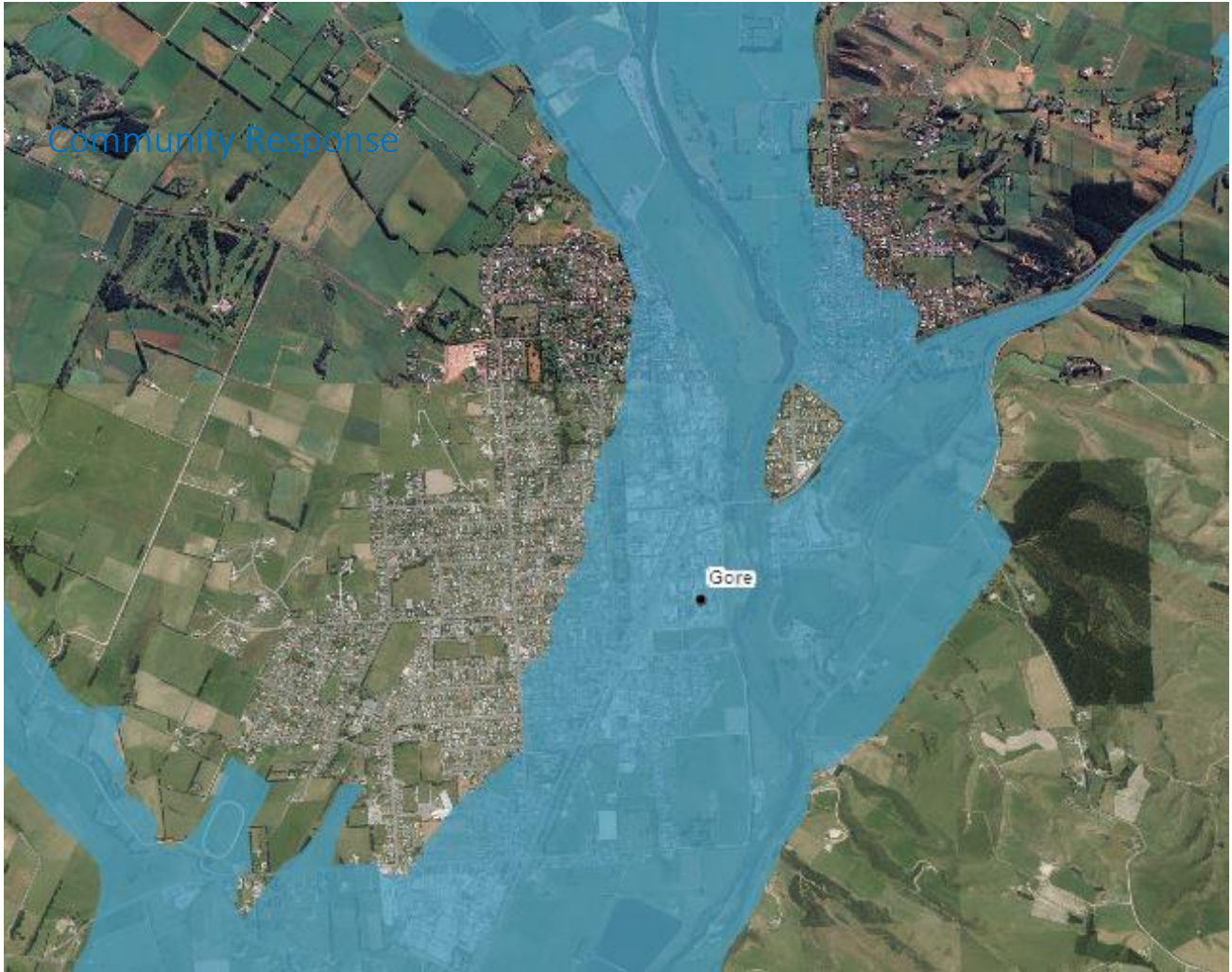
Figure 3: Gore potential flood Map